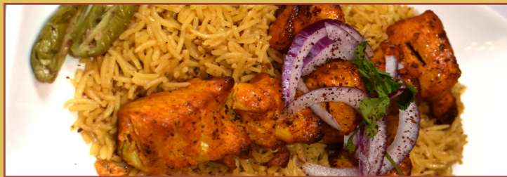
Chicken Breast Kabob